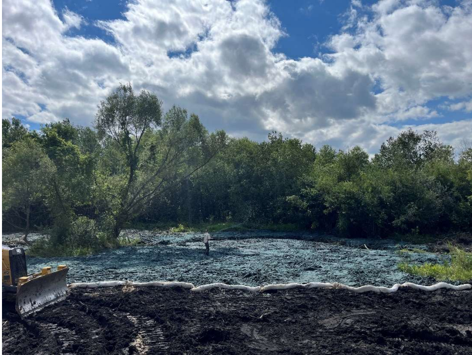
Picture above: Area seeded and hydromulched. Bio-logs installed above hydromulch to serve as redundant erosion control to achieve compliance with NPDES permit.