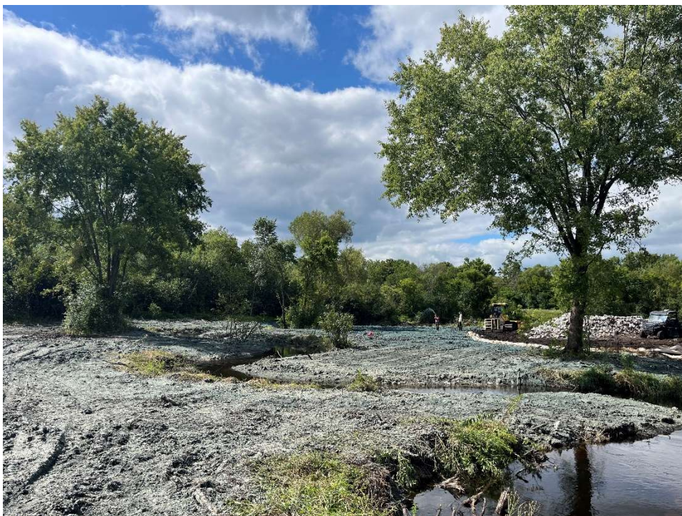
Picture above: Remeandered section that is seeded and hydromulched .