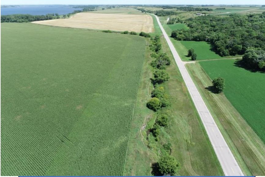
Phase 2: Prior Condition