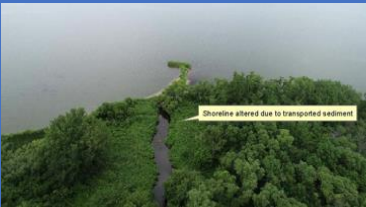
Phase 1: Prior Condition