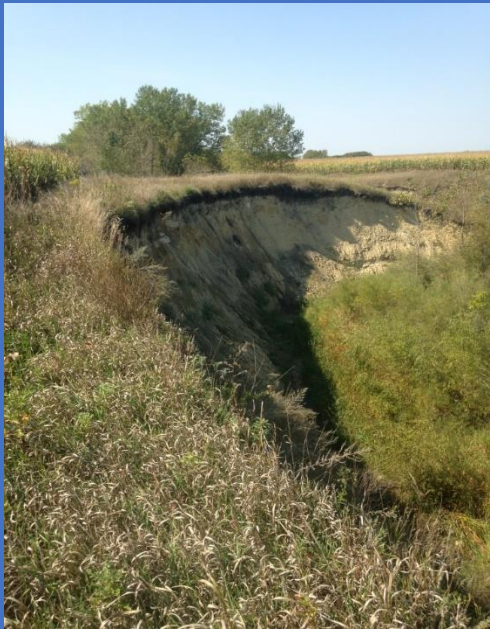
Phase 3: Prior Condition