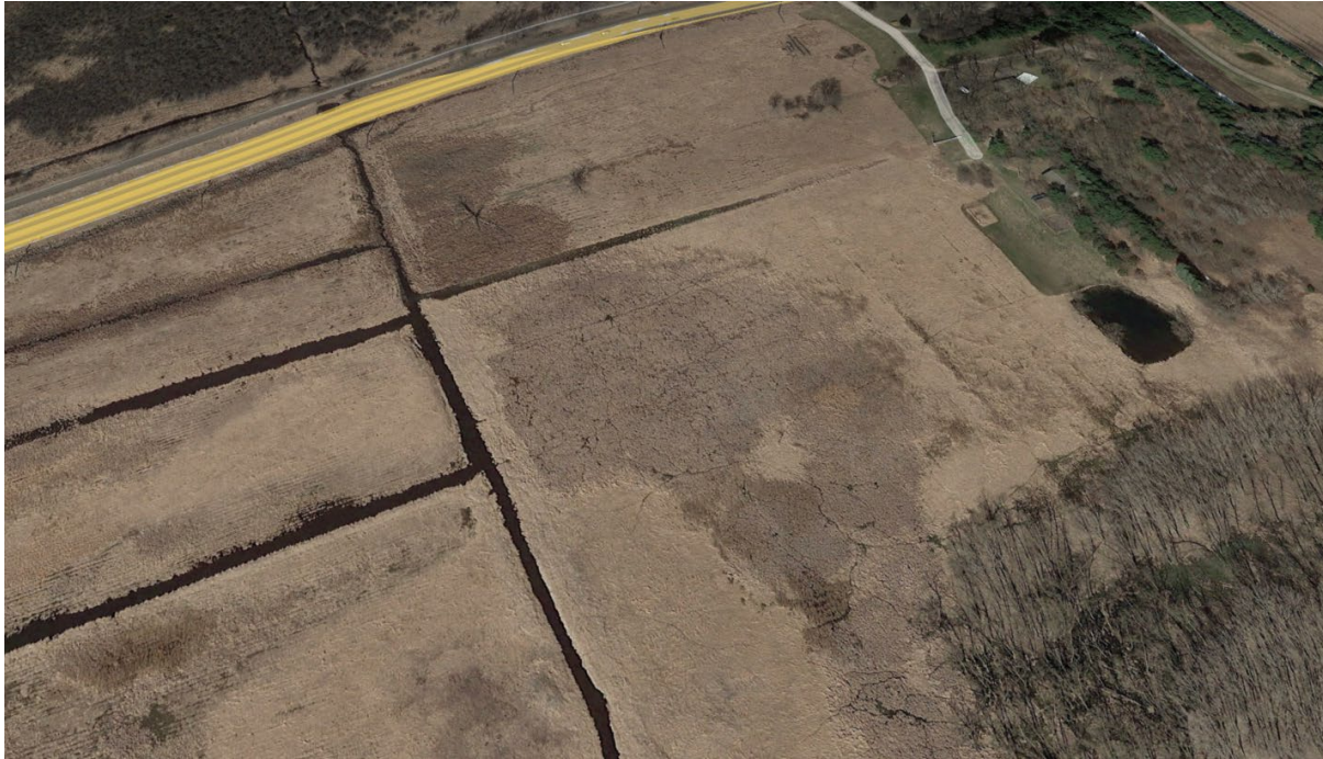
Before - Aerial imagery