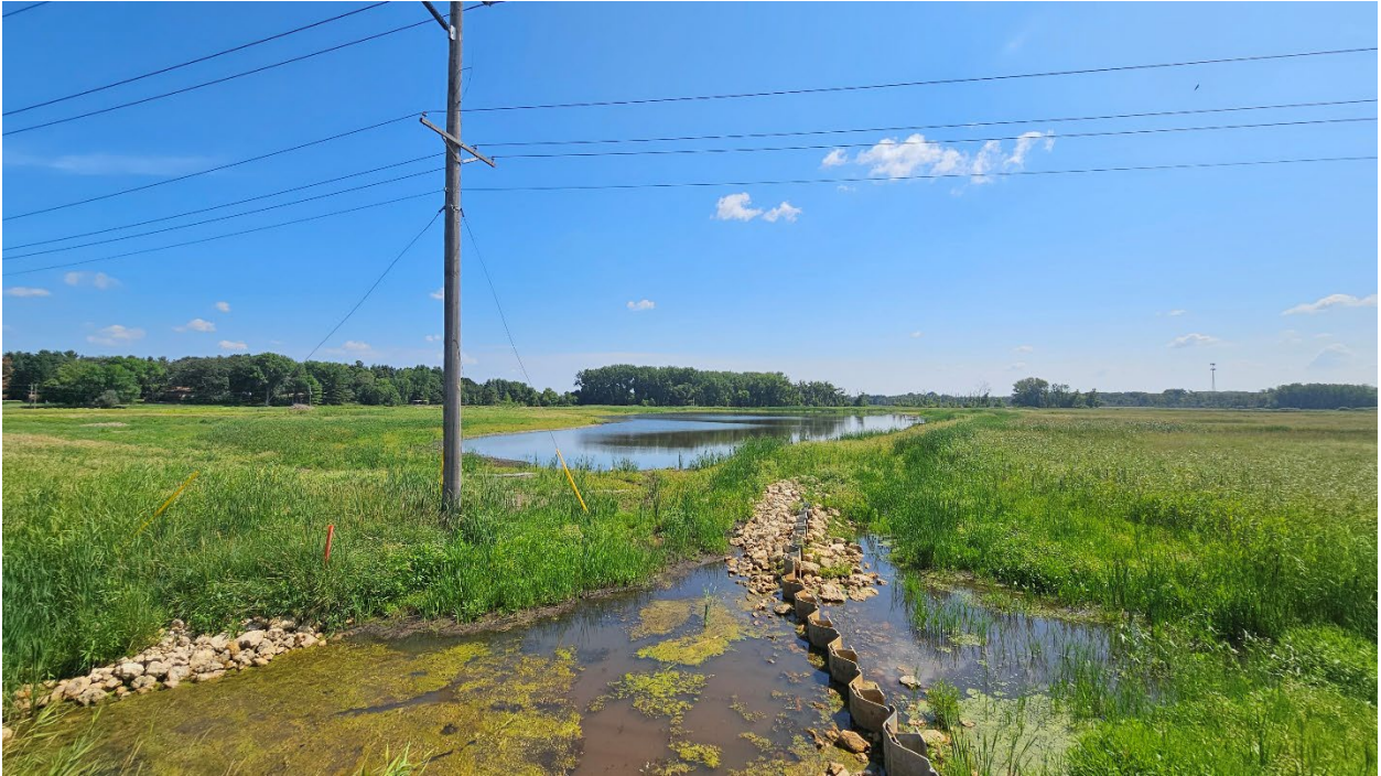
Heims ditch diversion weir - Summer 2023