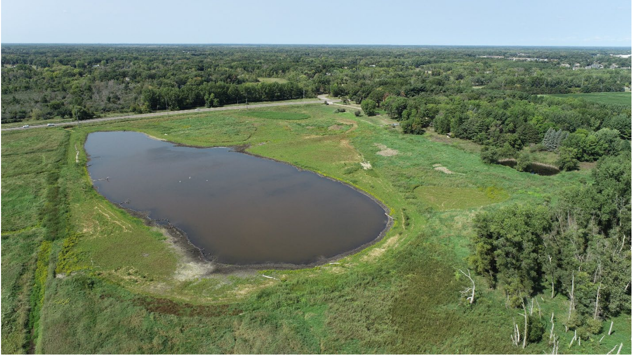
After - Summer 2023 – Drone imagery