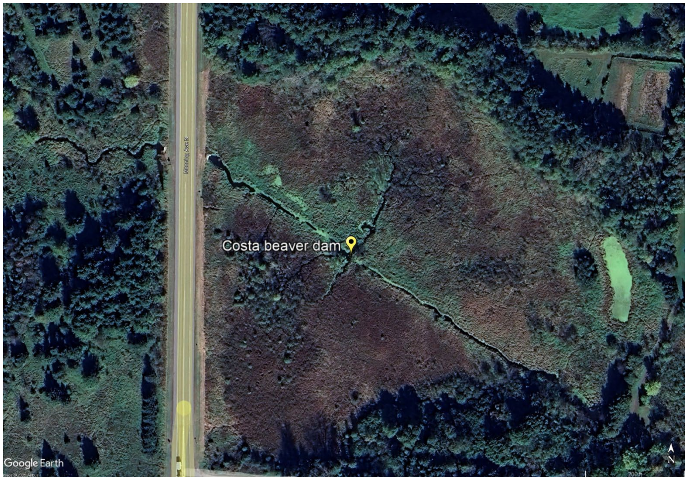
Figure 3. Location of the large beaver dam in the Costa wetland.