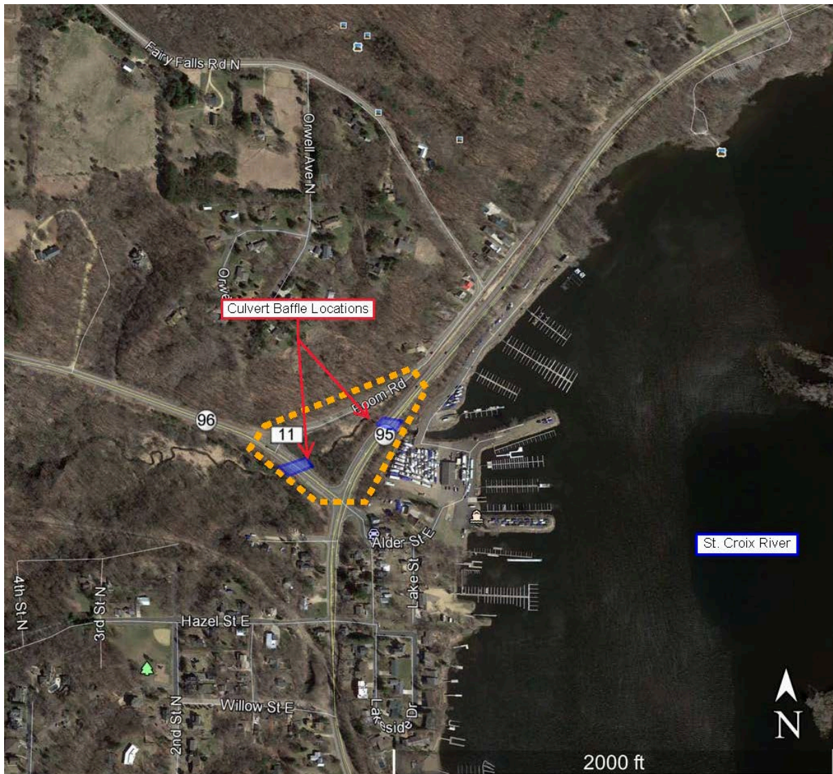
Figure 1. Location map for State Highway 95 & 96 Fish Baffles.